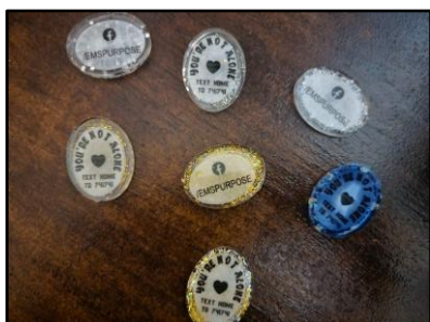
You’re Not Alone Coins